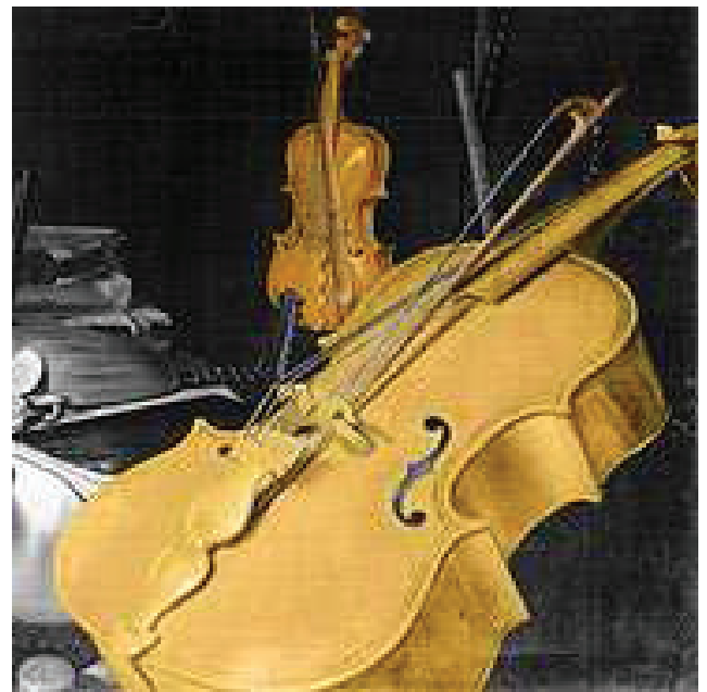
Figure 1. Basso di violino , Pieter Claez (c.1597–1660), Still-Life with Musical Instruments, Harlem, 1623, Musée du Louvre RF 1939-11.

In the Pieter Claez painting figuring a Basso di violino painted in 1623 (Fig.1) nevertheless, the bridge is placed at the nicks of f-holes, from which we conclude that there was no standard in this matter. Here, the distance between bridge and tail-piece is proportionally very small, with a particularly long and flat tailpiece, whose shape has an intricate outline, showing remains in the baroque era of Renaissance fixtures, but much simpler (see below the large Renaissance tailpiece Musée de la musique E.999.9.1).