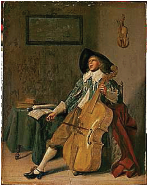
Figure 2. Dirk Hals' self-portrait as a cello player, (1591 – 1656) Akademie der Bildenden Kuenste Oil Inv. 734, Vienna.

A representation of a basse de violon can be seen in the Grande chapelle royale of the Chateau de Versailles , built by Hardouin-Mansart between 1698 and his death in 1708, and was then finished in 1710.