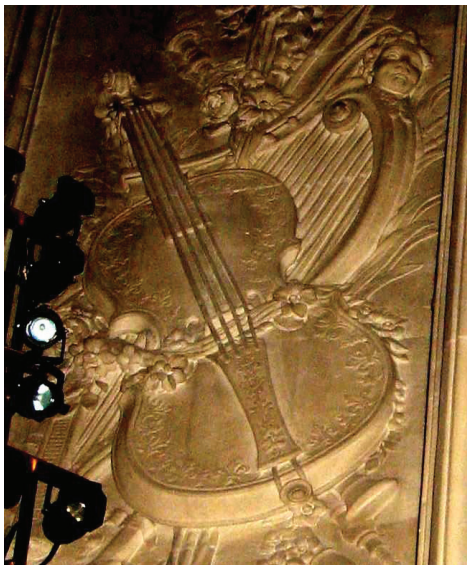
Figure 3. Basso di violino, Chapelle royale du Chateau de Versailles.

A representation of a basse de violon can be seen in the Grande chapelle royale of the Chateau de Versailles , built by Hardouin-Mansart between 1698 and his death in 1708, and was then finished in 1710.