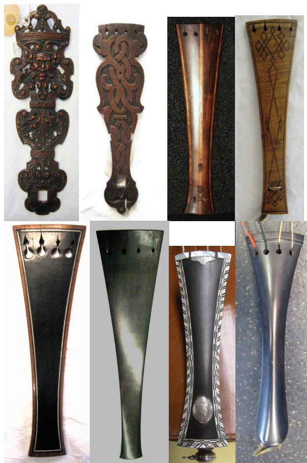
Figure 7. Tail pieces kept in Musée de la musique : 1. 6-strings tailpiece, MM E.999.9.1, Rothschild's sale. 2. 4-stings tailpiece, MM E.487 C.161 Given by Vuillaume, ascribed by him to Stradivari. 3. 4-strings tailpiece ascribed to Amati Brothers 1695 given by Vuillaume E.903. 1. 4. Cello tailpiece with inscription « Stradivarius », 17 th c. E.619 C.193 given by Eugène Gand 1874. 5. Cello tailpiece ascr. to Stradivarius, E.486.2 C. 192, given by Vuillaume 1873. 6. Cello tailpiece ascr. to Stradivarius, c.1720, E.486.1 C. 192, given by Vuillaume 1873. 7. Child's cello tailpiece, Léopold Renaudin c.1780. E.981.4.1. 8. 8. Modern 19 th c. cello tailpiece, mounted on the cello made in the 19 th century from a re-cut 17 th c. bass violin M.M. E.974.10.1.