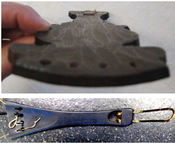
Figure 9. 17 th century 4-stings tailpiece MM E.487 compared to a 19 th century thick industrial cello tailpiece.